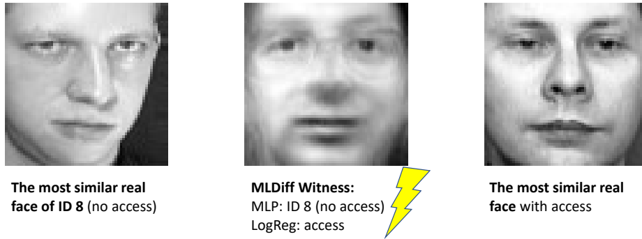
Fig. 2. A conflict of an MLP and a LogReg classifier detected by MLDiff [middle] where the LogReg classifier grants access when the MLP classifier would deny it based on the determined employee ID 8. Closest representatives of the dataset from both classes are shown [left] and [right] from the Olivetti Faces dataset [23] for illustration purposes

Definition 2 (MLDiff Classifier Combination). Given classifier cl_1 : \mathbb{R}^{|X_1|} \rightarrow C_1 and classifier cl_2 : \mathbb{R}^{|X_2|} \rightarrow C_2 we construct the MLDiff classifier combination cl_1 \oplus cl_2 : \mathbb{R}^{|X_1 \cup X_2|} \rightarrow C_1 \times C_2 such that